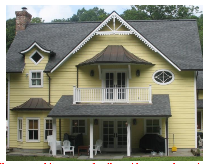
Soon after purchasing the Sedlack Home, the Ruck Family convrted it to a one-family residence as shown in the above front and rear-view pictures of the home. The Ruck's eventually sold their home.