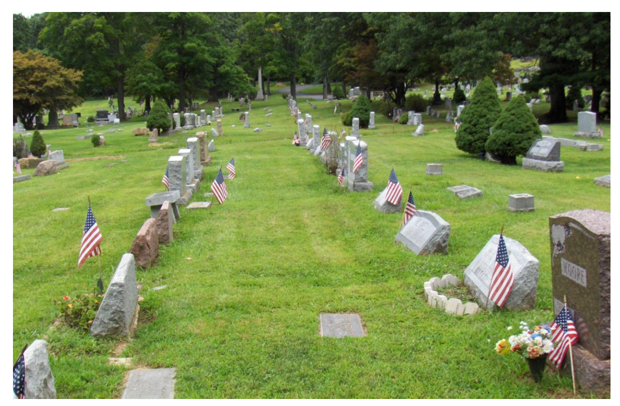
Rockland Cemetery